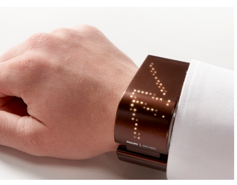
Figure 6. EmoBracelet in ambient mode, corresponding to low-arousal.