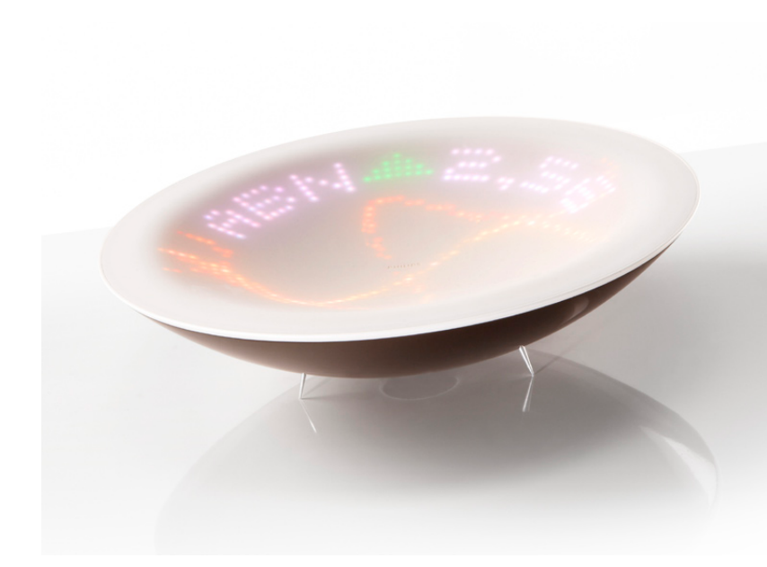
Figure 11. The EmoBowl in information mode, showing tickertape messages