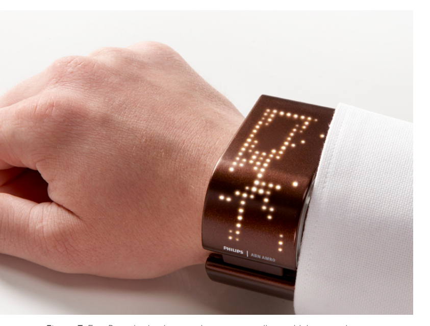
Figure 7. EmoBracelet in alert mode, corresponding to high-arousal.