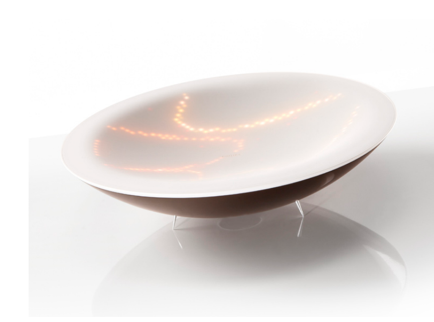
Figure 9. The EmoBowl in ambient mode, corresponding to low arousal.

Rationalizer can also be seen as a first step to come to a product language in which emotions are communicated in a domestically appropriate manner. We shared some of our considerations in developing