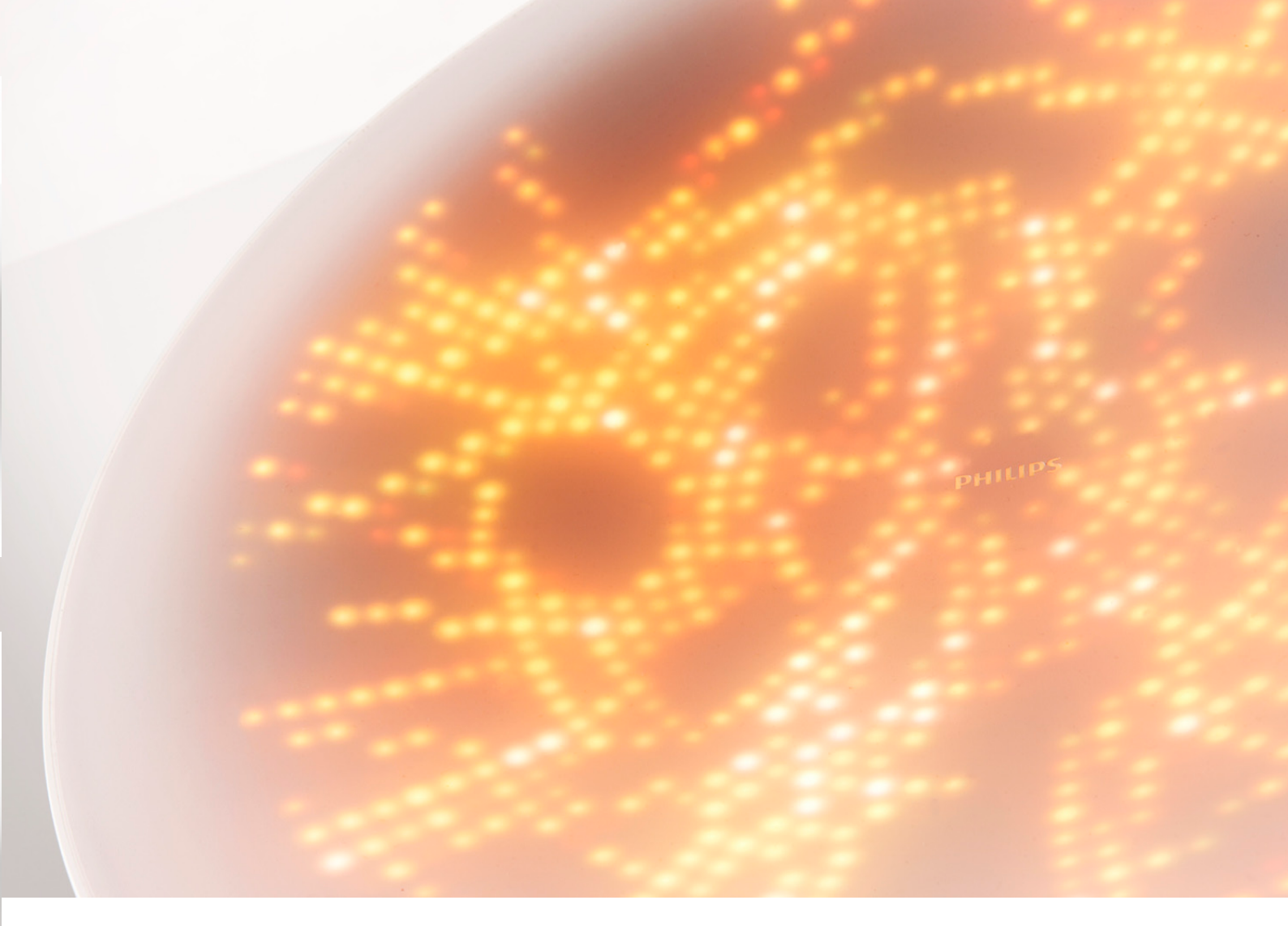
Figure 12. The EmoBowl can function as a 'high-res luminaire': the 1600 LEDs together are the equivalent of a 100W light bulb

this product language and improving the user experience of emotionally intelligent products from a semantic point of view. These considerations concern the aesthetic fit with our domestic environment, the connotations of sensor placement and the appropriate display of emotional information. Moving emotion technology from the laboratory into the home requires semantic considerations on many levels. Whilst this may hold for any type of innovation, it is especially true for emotion technology: the contrast between technology and human values is perhaps nowhere as jarring as here.