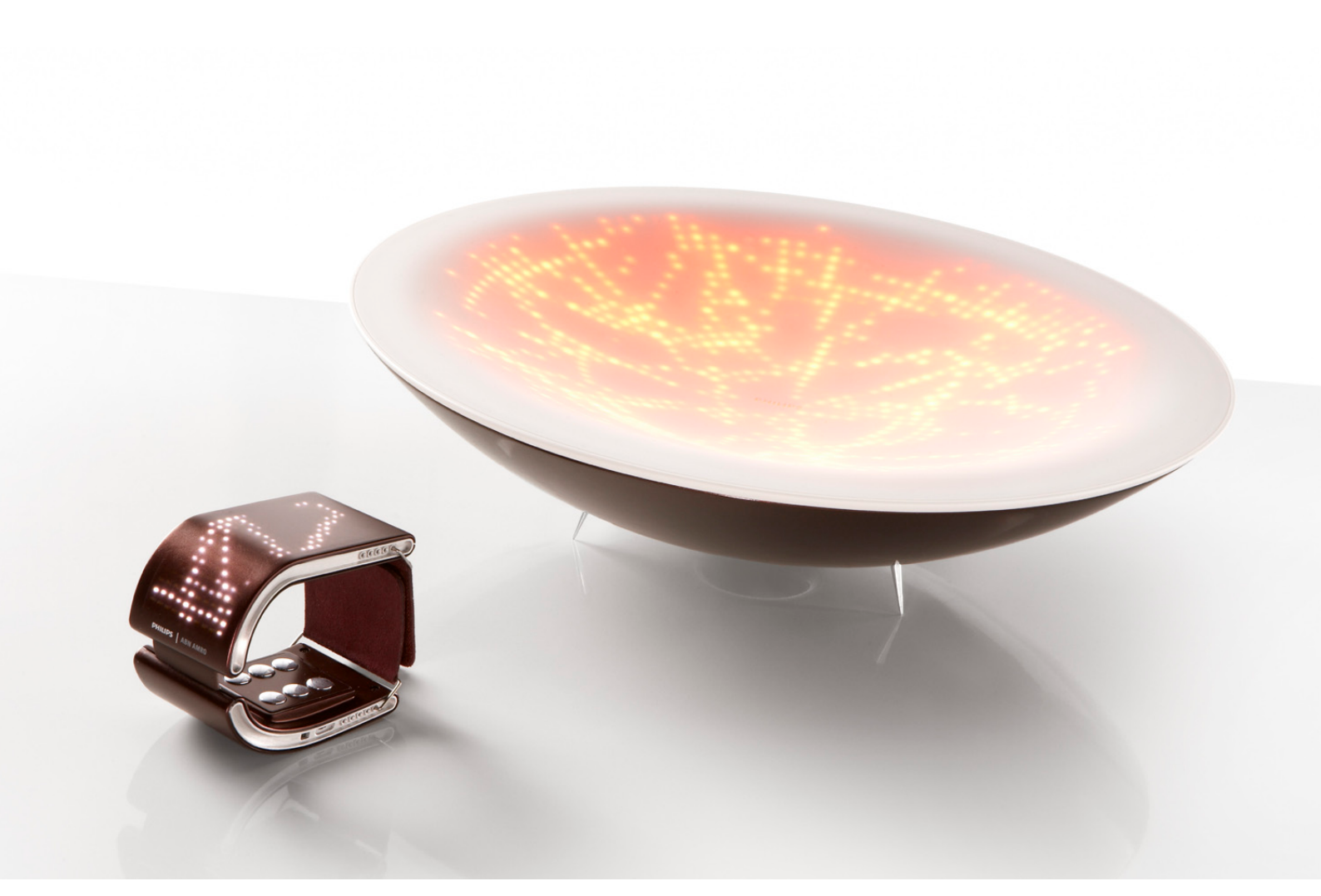
Figure I. EmoBracelet and EmoBowl.

dynamic light pattern on the bracelet is that sensing and rendering become integrated in a self-contained device and no further objects are necessary. At the same time, we expect that some people may feel that a light pattern on a bracelet may simply be 'too much' and that they feel uncomfortable with the idea of 'a Christmas tree on their wrist'. When using a separate object such as the EmoBowl for rendering, the bracelet could be reduced to a simple measuring instrument without display capabilities and thus become more modest in size and more restrained in appearance.