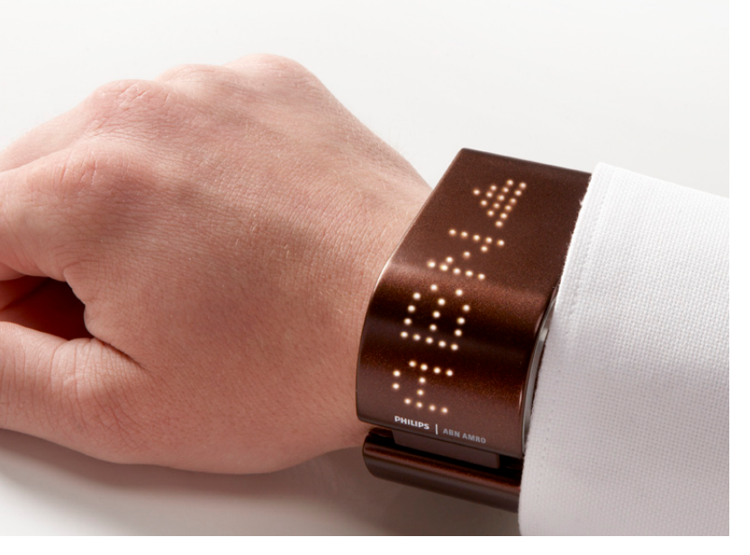
Figure 8. EmoBracelet in information mode, acting as a tickertape display with stock info.