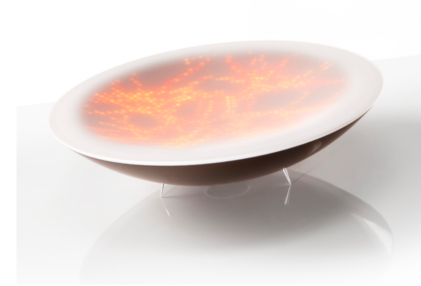
Figure 10. The EmoBowl flaring up to alert mode, corresponding to high arousal.