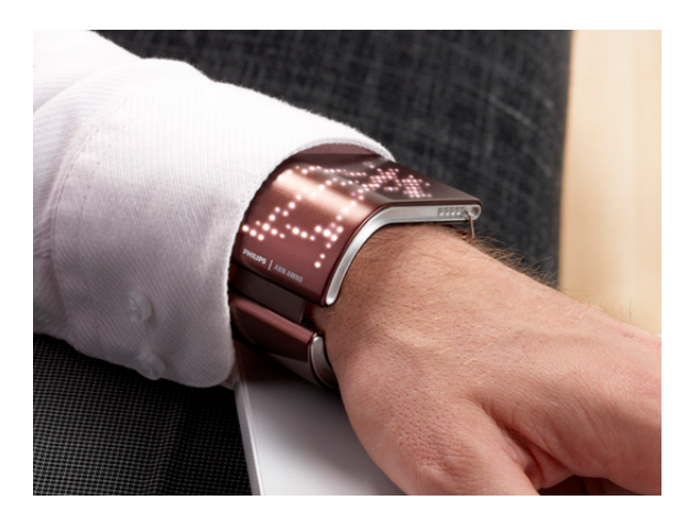
Figure 2. The EmoBracelet is an integrated emotion sensing and rendering device worn on the wrist.

reminiscent of the old days of VR data gloves, giving the user a cyborg-like appearance. Using head bands or sensors on the feet may be even more problematic. Interesting here is that these are predominantly semantic issues. Though sensing devices designed for these locations may work fine from a technical and ergonomic point of view, the values and connotations which come with these sensor embodiments are at odds with the values associated with the application. Even when a sensor head band is dressed up as a wireless tiara, even when the sensors are elegantly embedded within shoes or socks, the associations that come with these sensor locations are simply unacceptable for a business-like application such as online trading. For these reasons, we settled for embedding the GSR sensor in a watch-like product (Figure 2). Although the wrist is not the most optimal location to measure, it is a well accepted location for wearing technological devices.