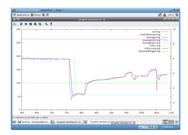
Figure 3. A plot showing galvanic skin response.

accommodating for different wrist sizes. Currently, the active tips are appointed manually. However, we envisage that the software could automatically identify the two tips which provide the best signal. Figure 3 shows a plot of a GSR signal. The signal processing algorithm determines an upper and a lower limit. When the signal exceeds either limit an 'emotion event' is generated and the limits are adjusted. This particular plot shows a sharp drop in resistance corresponding to heightened arousal, triggering an 'emotion event', followed by a 'recovery'. Though there are some small 'emotional aftershocks', these stay within the new limits.